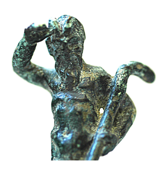
Fig. 2. Detail

The Greeks and Romans used a number of methods to fashion bronze sculptures. For small pieces such as ours, the lost wax method was preferred.<sup>2</sup> By this method, a model of the sculpture was first made out of wax. This could either have been solid, or it could have been sculpted over a core (made from a material with suitably high melting temperature) with little pins called chaplets sticking out through the wax. The model was then covered in two sets of clay coating. The first set comprised a single layer of fine clay that preserved the details of the sculpture, and the second set