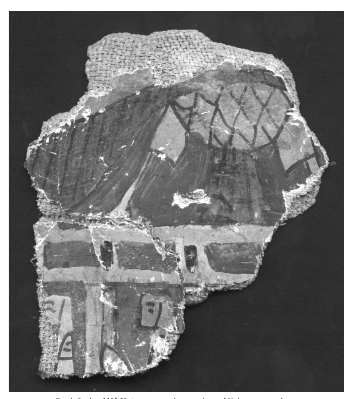
Fig. 1: Durban 2005.50. A cartonnage fragment from a 21<sup>st</sup> dynasty sarcophagus.