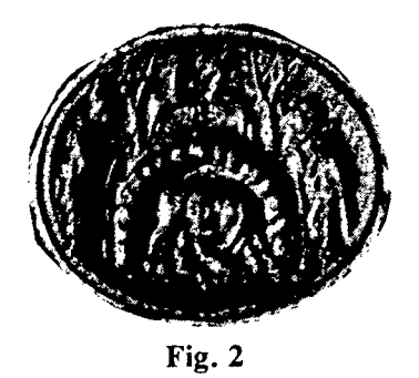
Late Republican coin (impression). (Lexicon Iconographicum IV.2, p.68.)