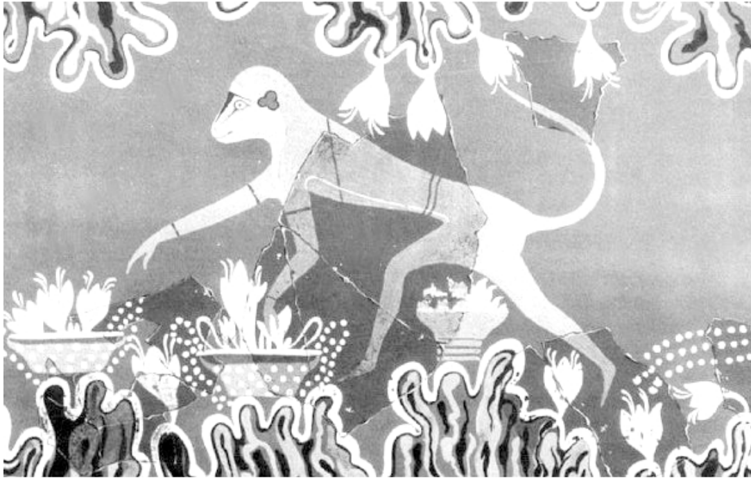
Fig. 1: Detail from the Saffron gatherer wall painting at the palace of Minos, Knossos, c. 1550 BC.

Egyptian Nile plants. These appear to depict landscape scenes rather than gardens, although there is some evidence of potted flowers at Knossos. There is no clear indication of gardens in homes. Cypress trees were apparently imported from Semitic countries (Farrar 1998:4–5).