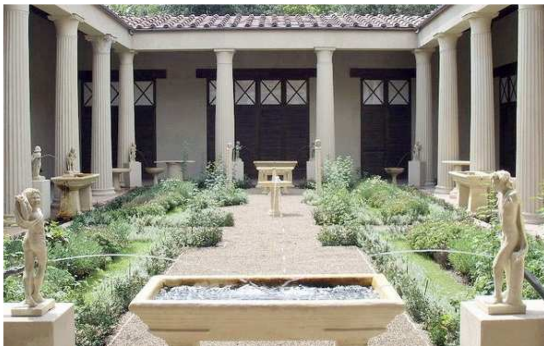
Fig. 3: Reconstruction by Sailko of the garden of the House of the Vettii, Pompeii. 1

House ( domus ) gardens featured prominently — originally they were vegetable gardens, but in time ornamental shrub, herb and flower gardens became popular. Gardens were situated either separately (but walled and attached to the rear of the house), or inside, and then predominantly in the peristyle , commonly around a central pool. Plants were usually planted in the soil, but occasionally in containers on the porticoes or colonnade. Beds for plants were known as areae , the cultivated fields on a farm were called agri (origin of agriculture). Trees for shade were commonly planted even in small peristyles . Planes and cypress trees were popular, as well as fruit trees (e.g. vine, olives, pears, apples, figs, cherries and lemon [citron]). Shrubs, herbs and flowers were selected to ensure an evergreen effect, turning the peristyle into a veritable pleasure-garden in which the family could relax, eat or perform domestic chores, like weaving or needlework.