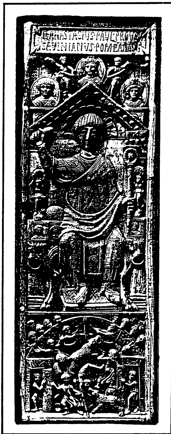
III. 2: Diptych of the Byzantine Emperor Anastasius (491-518) (Staatliche Museum, Berlin)