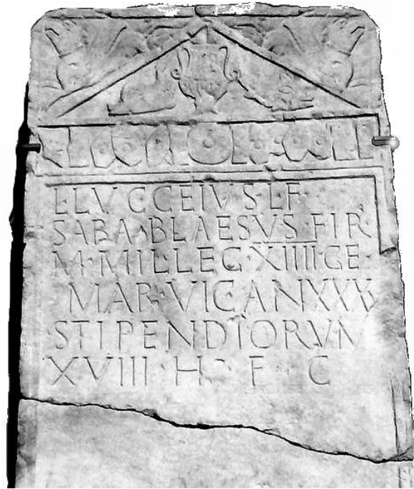
Fig. 3. Tombstone of a soldier in XIV Gemina

L (VCIVS) LVCCEIVS L (VCII) F (ILIVS) SABA (TINA TR.) BLAESVS FIR- M (O) MIL (ES) LEG (IONIS) XIII GE (MINAE) MAR (TIAE) VIC (TRICIS) AN (NORVM) XXXV STIPENDIORVM XVIII H (ERES) F (ACIENDVM) C (VRAVIT)