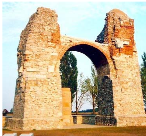
Fig. 2 The tetrapylon at Carnuntum

Carnuntum is well worth a visit. 6 It lies in attractive countryside with well preserved archaeological remains. It is situated next to the village of Bad Deutsch-Altenburg on the Danube some 40km down-stream from Vienna. A civilian town grew up near to it, at modern Petronell. The remains of two amphitheatres, baths, temples and other structures are still visible. The most notable monument is the Heidentor, or the Heathens' Gate, as it came to be known in the Middle Ages, an impressive tetrapylon or four-columned arch, two of whose pillars remain ( Fig. 2 ).