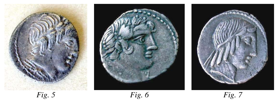
In figs. 4, 5 , for instance, they share both the diadem and thunderbolt as attributes. There are differences, however: handsome Apollo, the epitome of male beauty, god of brightness, music and art, is usually shown laureate ( Fig. 6 ); sometimes he wears a fillet with his hair in ringlets ( Fig. 7 ).

usually carried a bundle of arrows, was sometimes accompanied by goats, and is often equated with Apollo.<sup>5</sup> Young Veiovis' likeness to Apollo is demonstrated on a number of coins.